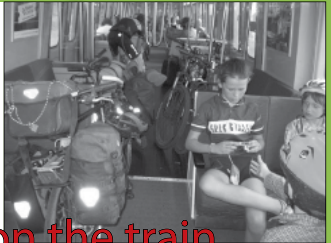
on the train