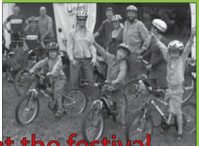
at the festival